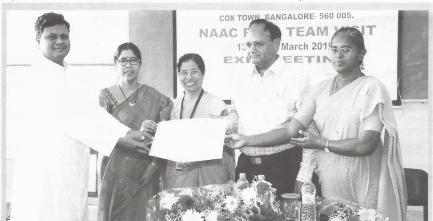
NAAC Exit Meeting