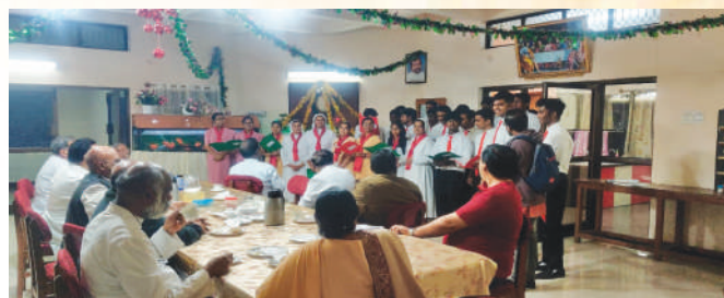
A Kind Gesture can bring a lot of joy

On 20th December, 2023, St. Aloysius Degree College organized an Outreach program in the spirit of Christmas, with enthusiastic participation from the management, staff, and students. The event was held at MEG Jagruthi School, Jerome Home, and Little Sisters of the Poor. The Students from all departments collected provisions for the children and residents, embodying the true essence of giving. The festivities began with Christmas Carol singing and lively dance performances, bringing joy and festive cheer to