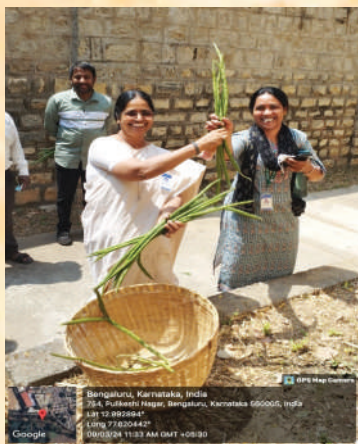
Maintaining a Clean Environment

in acquiring new seeds and fulfilling other garden requirements. These sustainable initiatives on campus pave the way for micro-scale gardening, providing students with hands-on educational experiences and enhancing their understanding of food systems.