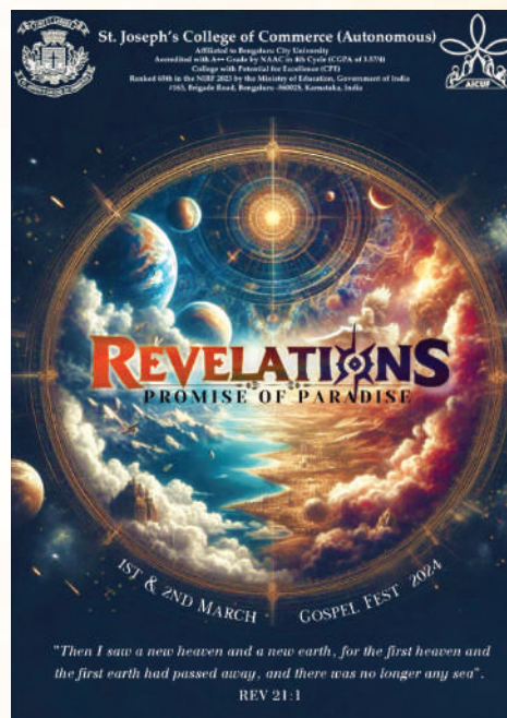
A Creative Approach

The students from St Aloysius Degree College enthusiastically took part in 'REVELATION: PROMISE OF PARADISE,' an event organized by St. Joseph College of Commerce. Their fest,