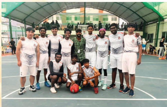
Talent at its best

The Game On Sports Fest 2023-24, hosted by Transend Group of Institution on November 24th and 25th, was a brilliant display of athleticism and sportsmanship. Students from various colleges competed in numerous sports activities, filling the event with excitement and cheers. Our