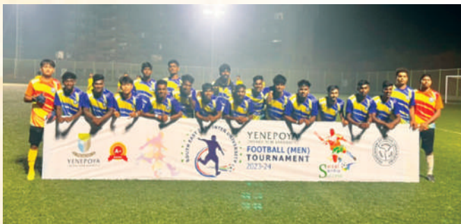
Champions Keep Playing

The South Zone Inter University Championship 2023-24, hosted by Yenepoya University in Mangalore from December 11th to December 14th, was a thrilling gathering of gifted athletes from diverse universities.