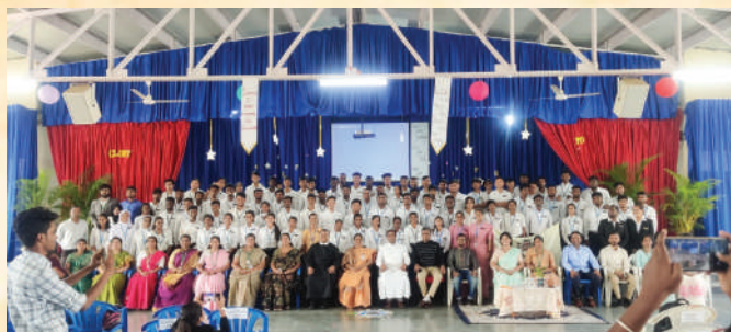
Making of a Good Leader