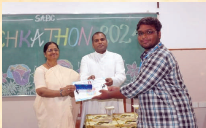
Exhibiting Technical Prowess - Techkathon 2024

Principal. The chief patrons addressed the gathering and wished for the IT fest.