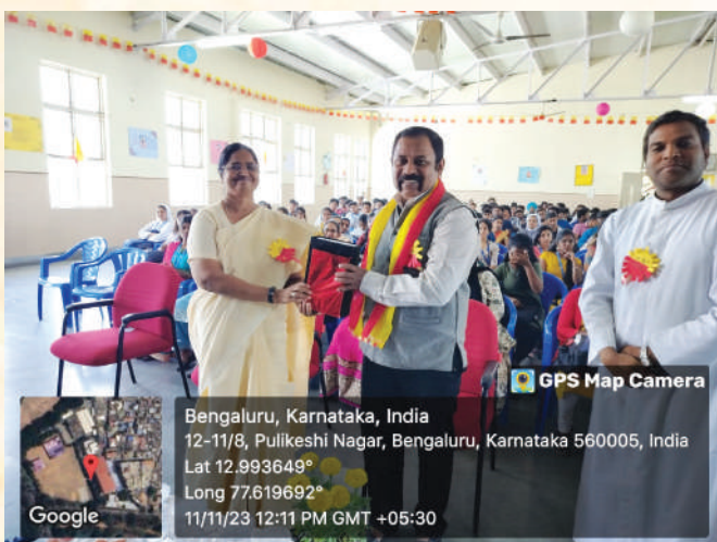
Commemorating the Foundation of Karnataka

The Investiture Ceremony held at St Aloysius Auditorium on the 11th of January 2024 marked a significant event in the academic calendar of the institution. The ceremony was attended by all students and faculty members, converging to witness the formal induction of student leaders into their