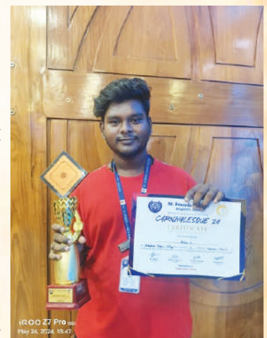
Keeping your body and mind fit

The tournament was held on 23th & 24th of May 2024 in St. Francis College, with great enthusiasm and sportsmanship. It brought together talented teams from various colleges, showcasing their skills and passion for the beautiful game of football. Our team's dedication, teamwork, and unwavering spirit were instrumental in our success throughout the tournament. The journey to the final match was filled with intense matches, where each player gave their best on the field, demonstrating exceptional sportsmanship and determination. The final game was a true test of our abilities, and despite the fierce competition, we emerged victorious, securing the 2nd place and earning recognition for our