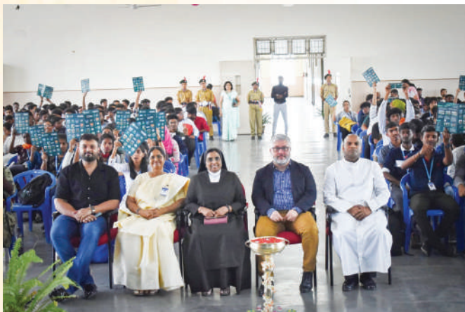
Multilingualism is the way to go...