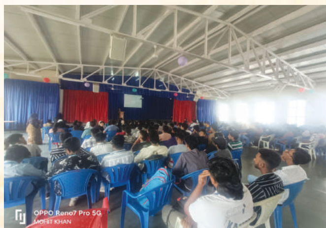
A Platform to Career

The campus recruitment session was held at St. Aloysius Degree College on June 3, 2024, conducted by Farid Constructions in collaboration with the placement cell of the college. The session aimed to identify and recruit talented final year students for various job positions within the company. The session was organized to bridge the gap between academia and industry, providing students with the opportunity to explore career options and interact directly with potential employers. The recruitment session saw enthusiastic participation from final year students across various disciplines, including engineering, management, and