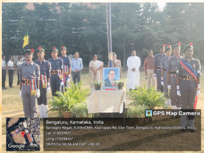
Republic Day: A Day to Reminisce

On January 26, 2024, St. Aloysius Degree College