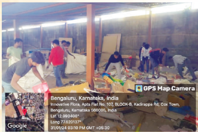
Dry Waste and E-Waste Segregation: A Sincere Initiative

On January 31, 2024, St. Aloysius Degree College in collaboration with WOW - Wellbeing out of Waste (an ITC Initiative), successfully conducted a waste segregation program to promote sustainable waste management on campus. Under the guidance of the ITC group Coordinator, The Eco Club efficiently recycled 876.65 kg of dry waste and