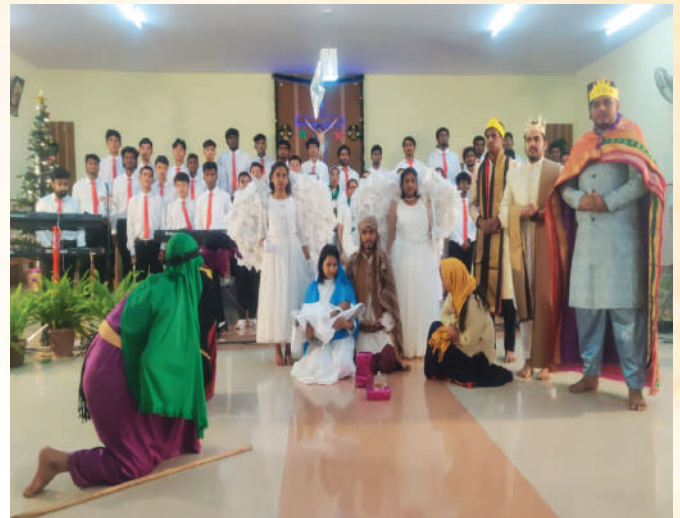
Choir that brightens the Christmas Cheer

On December 9th 2023, St. Aloysius Degree College hosted a delightful carol singing recording in the college chapel, an event that captured the spirit of the festive season. The recording, organized with meticulous care, featured the melodious voices of the college choir and was professionally recorded by Doordarshan. The chapel, adorned with festive decorations, provided a serene and uplifting atmosphere, enhancing the overall experience for