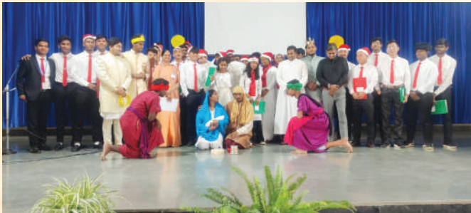
Ho Ho Ho - The Christmas Delight