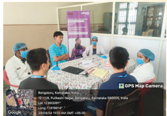
Dental Care is a must