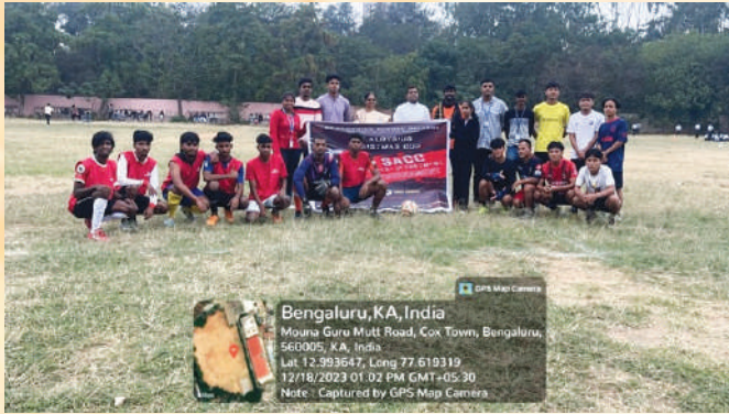
The Christmas Cup - Inter-Department Football

performance, demonstrating their skills and resolve on the pitch. Their proficiency in passing, dribbling, and goal-scoring propelled them to secure the runners-up position. Conversely, the 1st BA and BSW teams showcased remarkable teamwork and strategy, dominating their matches and emerging as champions of the St. Aloysius Christmas Cup. Their synchronized efforts, robust defense, and efficient offense enabled them to surpass their adversaries and clinch the tournament's top honors.