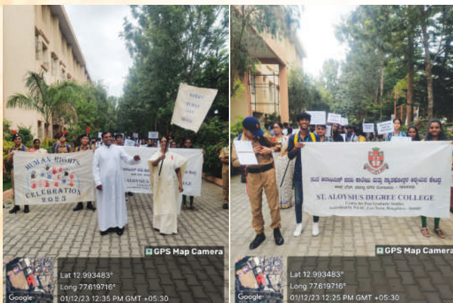
Your health is your wealth

On April 29th and 30th 2024 the dental awareness program was organized by Whistle & Smile clinical partner Clove Dental in collaboration with the Department of Physical Education. The dental checkup was held in our college