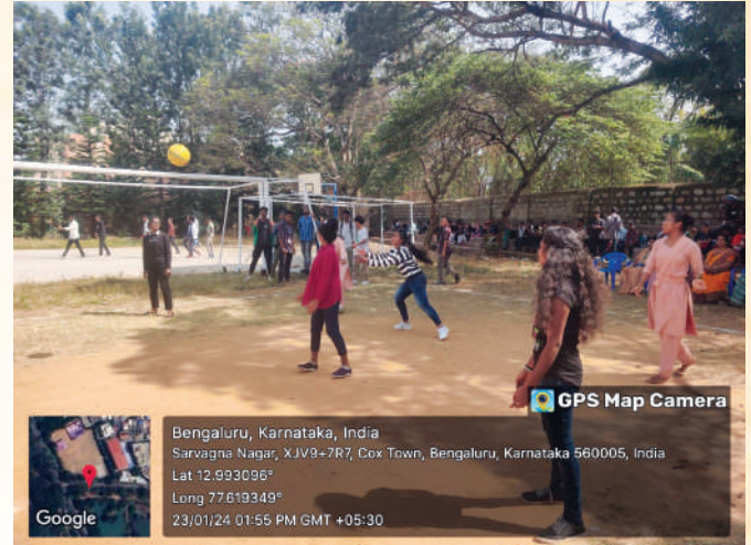
Behind every great woman is another greater woman.

Pongal Women Throw ball Tournament was held on January 17, 2023. The event was organized by the Department of Physical Education and was graced by Chief Patrons