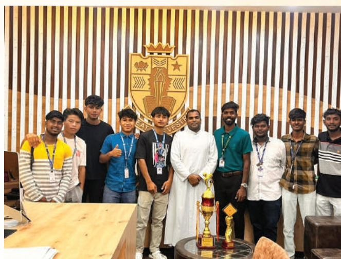
The Sweat, The Time, The Dedication - It Pays Off

The Bangalore North University Basketball Tournament, hosted by Kristu Jayanti College, was a riveting showcase