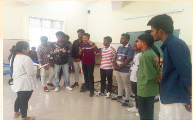
An aim to understand the transitioning from Campus to Corporate

On 13th May 2024, a session was conducted by Corporate Connexions in collaboration with the placement cell of St. Aloysius Degree College for all the final year students. The Career Guidance Group Discussion Activity aimed to provide a platform for the students to enhance their communication and critical thinking skills while discussing relevant career topics. Additionally, it sought to offer insights into professional development and job search strategies. The session began with an introduction to the importance of group discussions in career development. Participants were briefed on the agenda and objectives of the activity.